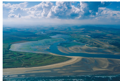
Aerial view of the Eden Estuary

Local Nature Reserves (LNRs) can be all sorts of places - woodlands, wetlands, meadows or coastal sand dunes. They provide wild spaces where plants and animals, both common and rare, can thrive. They offer unique opportunities to explore or study your local nature, or to simply enjoy them.