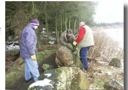
Fife Coast and Countryside Trust Maintenance Team

Examples of these projects are, renovation work at Tarvit Ponds, Cupar, improving paths in Kirkcaldy Woods and signage and interpretation works at Lady's Walk, Leslie.