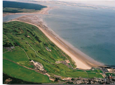
West Sands, St. Andrews

The Trust either manages or supports the 7 reserves that are located throughout Fife - Birnie and Gaddon Lochs · Coul Den · The Eden Estuary · Torry Bay · Cullaloe · Dalbeath Marsh and Gillingshill Reservoir.