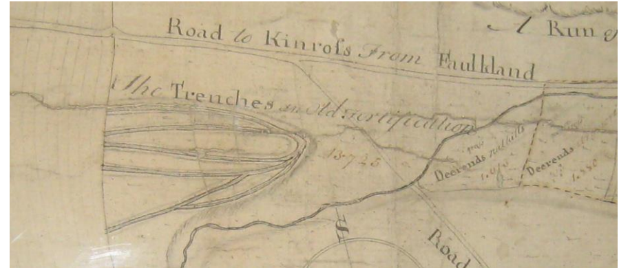
Detail from ‘ A Plan of the Estate of Nuthill, the Property of William Thomson Esq., surveyed by Thomas Winter, Anno 1757 ’ (owned by Falkland Estate). It is the earliest representation of The Trenches , which it terms ‘an Old Fortification’. Note also the fields or enclosures called ‘Deerends’ to the west (right-hand side). The ‘Road’ lower right is ‘Road to Arngosk’ i.e. Arngask.

Passing Chancefield [ Chancefield 1828, ‘happy or fortunate field’], another of the 1820s farms (see Westfield, above), we join a straight farm-road, also created in the 1820s, and make a short detour to the old farmstead of Kilgour [ Kilgouerin 1224, Kilgoueri & Kilgoueryn c.1250, Kylgouerin 1275, Kilgoveri 1329, Kilgoure 1417, Gaelic cill ‘church’ + a saint’s name Gobhran or a burn-name containing Gaelic gobhar ‘goat’], the old name for the parish of Falkland and the site of the parish kirk till early 17th century, marked by a small, overgrown graveyard. A little south-west of Kilgour stood the lost farmstead of Cairngate [ Carcat 1507, Carncatt 1510, Cairnegat 1606, Karnecatt 1654, Kirncat Bank 1757, Cairngate 1782, Gaelic càrn + Gaelic cat ‘cairn of wild cats’]. Above us are the Arraty Craigs , from which flows the Arraty Burn through the Arraty Den [ Arraty-Den 1602, possibly containing Old Gaelic arrachta ‘strong, vigorous, bold’, apt for the Arraty Burn as it tumbles down the steep north side of the Lomonds].